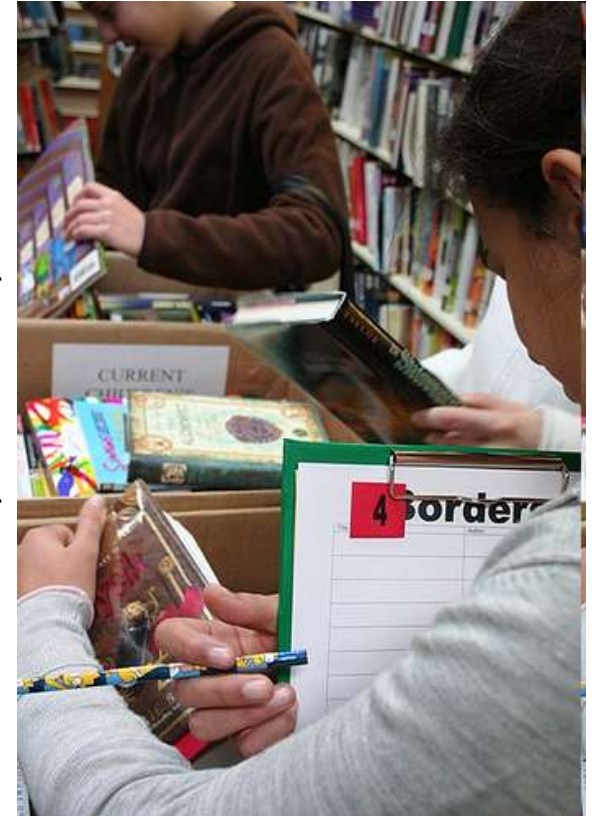
Mosman Library, Australia.