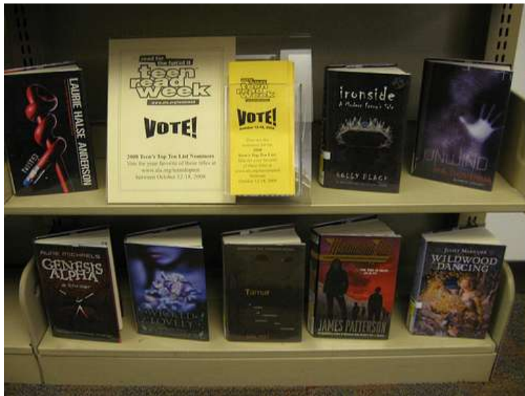
Franklin Park Library (IL)