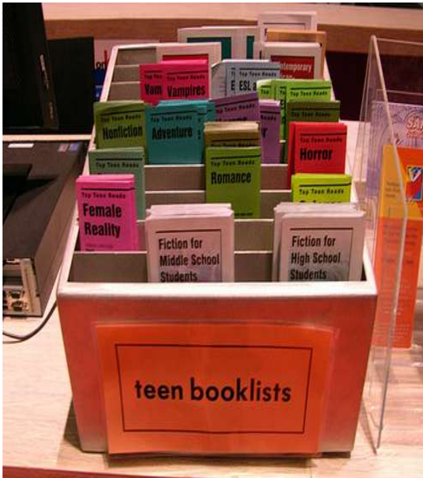
Seattle Public Library.